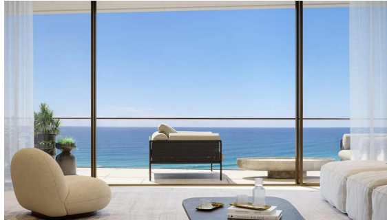
📷 Inside one of its units.

“The sales campaign for Mondrian Gold Coast private residences has been hugely successful, but this development is completely unique and beyond anything else available on the market and buyers of prestige property responded quickly,” he said. “There was no time for delay for those interested in buying an apartment as there were waiting lists for many of the apartments.”