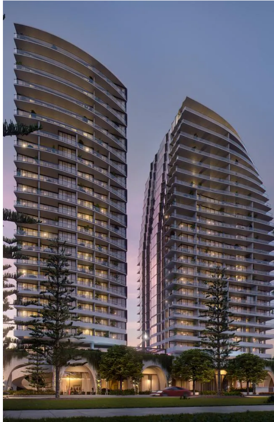
📷 Construction has begun.