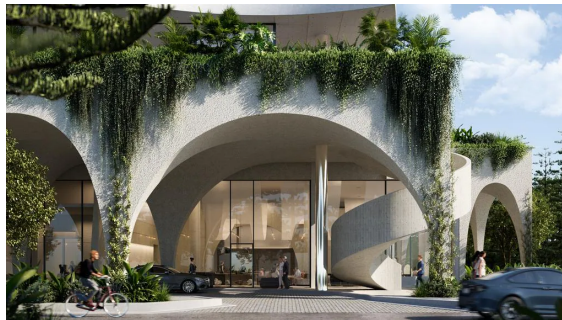
📷 The ground floor of the tower.

The buildings will be staffed by more than 200 people once open.