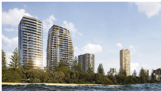
📷 Mondrian Burleigh Heads